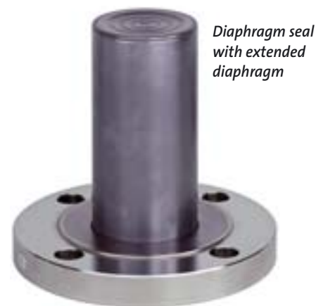
Diaphragm seal with extended diaphragm