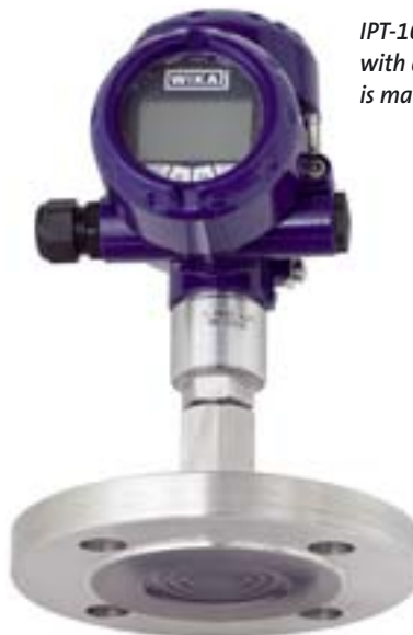
IPT-10 process pressure transmitter with a diaphragm seal. The diaphragm is made of tantalum.